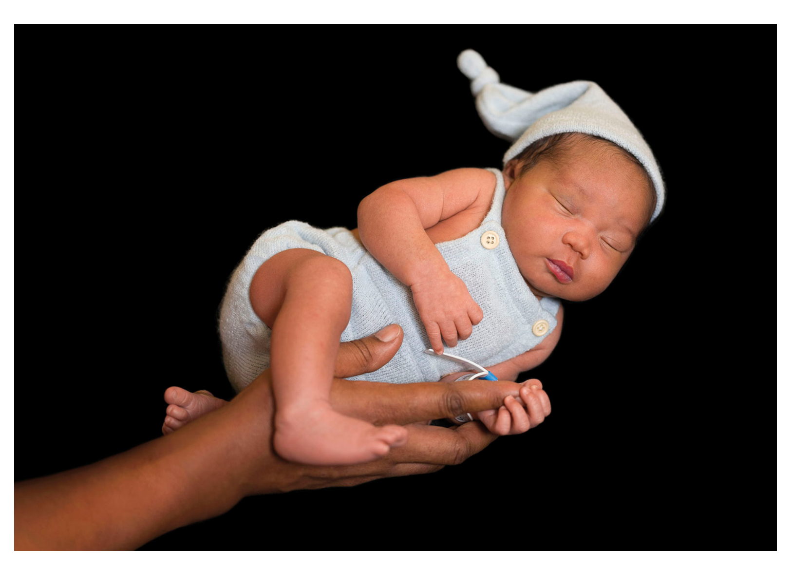
Hero, Nigeria GFX 50S + GF63mmF2.8 at f/2.8, 1/125 sec, ISO 400

As such, I was usually able to set up my camera consistently at f/2.8, 1/125 sec, ISO 400, in order to give a beautiful, soft feeling yet full of details, and at the same time the freedom to use the camera handheld.