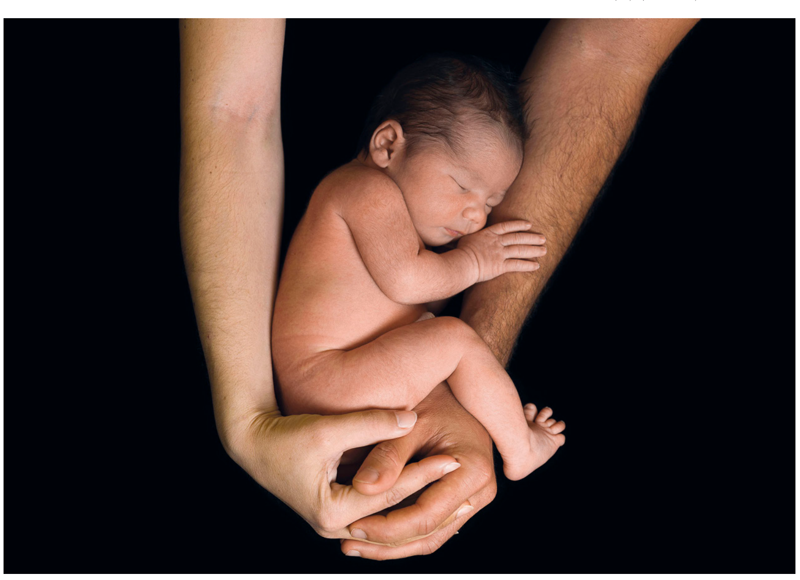
\label{eq:ambra} Ambra, Italy \\ \text{GFX 50S + GF32-64mmF4 at f/4, 1/125 sec, ISO 400}

For my past artistic endeavours, I was used to working with medium and large format analog cameras. Since then, technology has changed and when first I encountered the Fujifilm X Series, I fell in love with the cameras. I found them to be practical, light, of excellent quality and extremely beautiful.