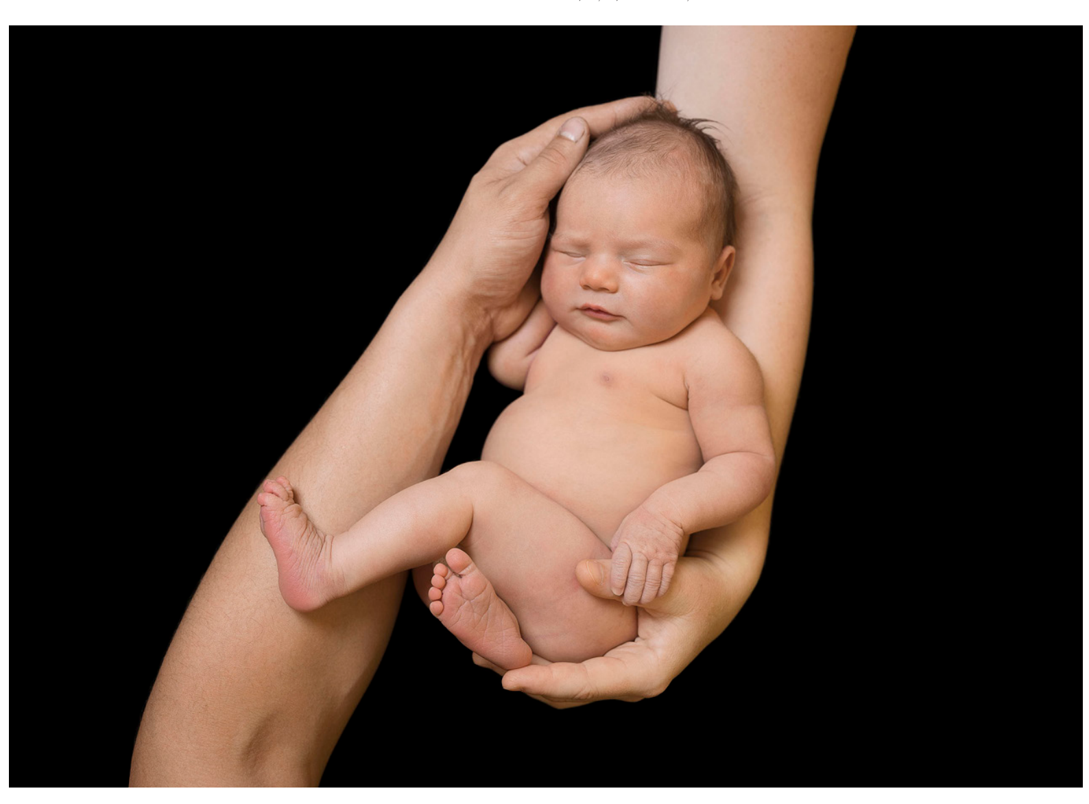
Ecaterina, Romania GFX 50S + GF32-64mmF4 at f/5, 1/125 sec, ISO 800