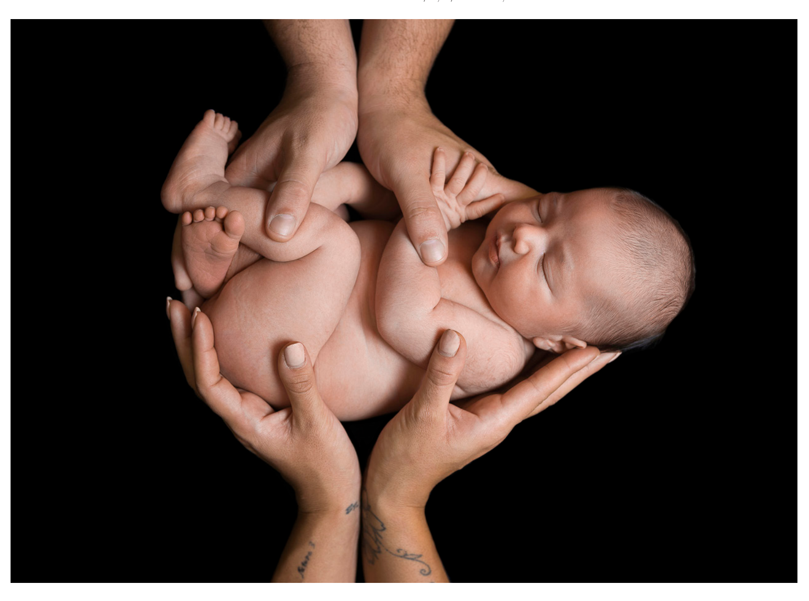
William, Italy GFX 50S + GF63mmF2.8 at f/4, 1/125 sec, ISO 400

During this project, they were many challenges. Some days, for example, I ended up photographing seven newborn babies – that's a lot! Sometimes the parents were stressed, which ended up being transferred to their babies, although part of a photographer's job is to try to anticipate and control all those aspects before we start shooting. After explaining the particular pose to the parents, the next step was to make them all comfortable