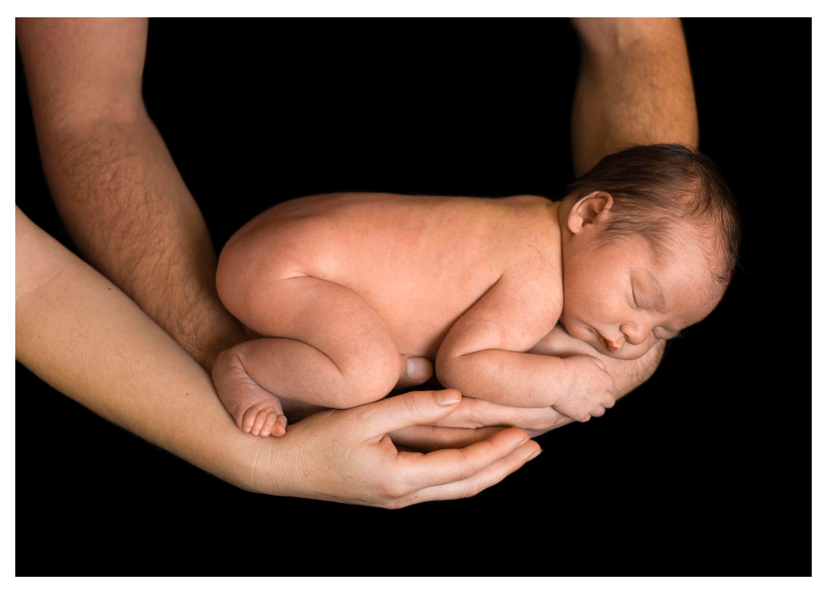
Nicola, Romania GFX 50S + GF32-64mmF4 at f/4, 1/160 sec, ISO 500

Using the GFX 50S, I was able to rediscover the light weight of a mirrorless camera and the unlimited quality of the medium format combined. The quality of the lenses, alongside the incredible dynamic range of the camera, delivers beautiful images, particularly when printed in large sizes on fine art papers.