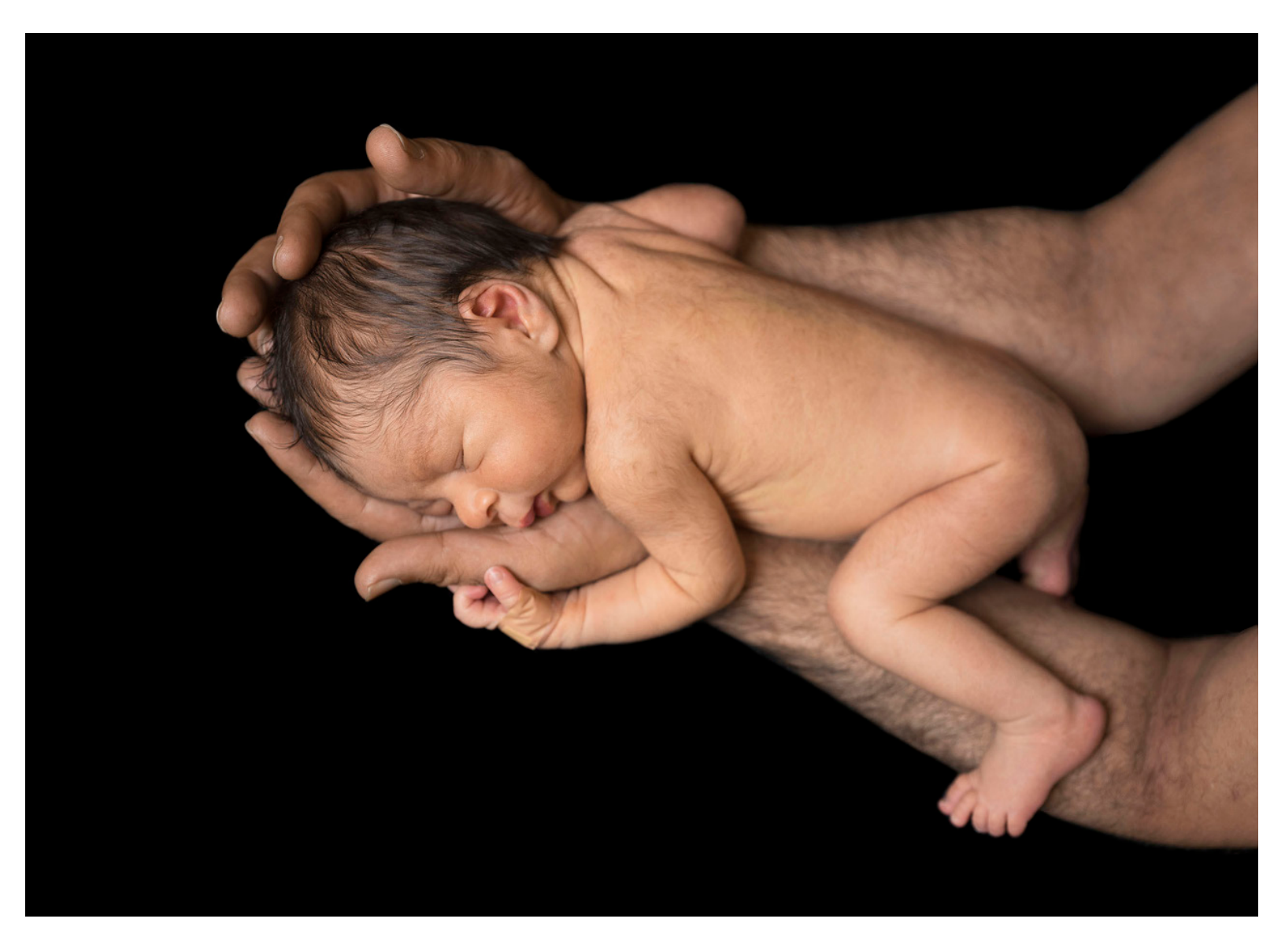
Adem & Abdul, Iraq GFX 50S + GF32-64mmF4 at f/4, 1/160 sec, ISO 500

The GFX 50S gave me the opportunity to use touchscreen focus, which proved itself invaluable for some poses. That, along with the tilting screen, gave me the opportunity to control my point of view exactly. This camera was very natural for me to use and I feel it offers the same maneuverability of a mirrorless with the best quality of a medium format. This camera is my new FujiLove!