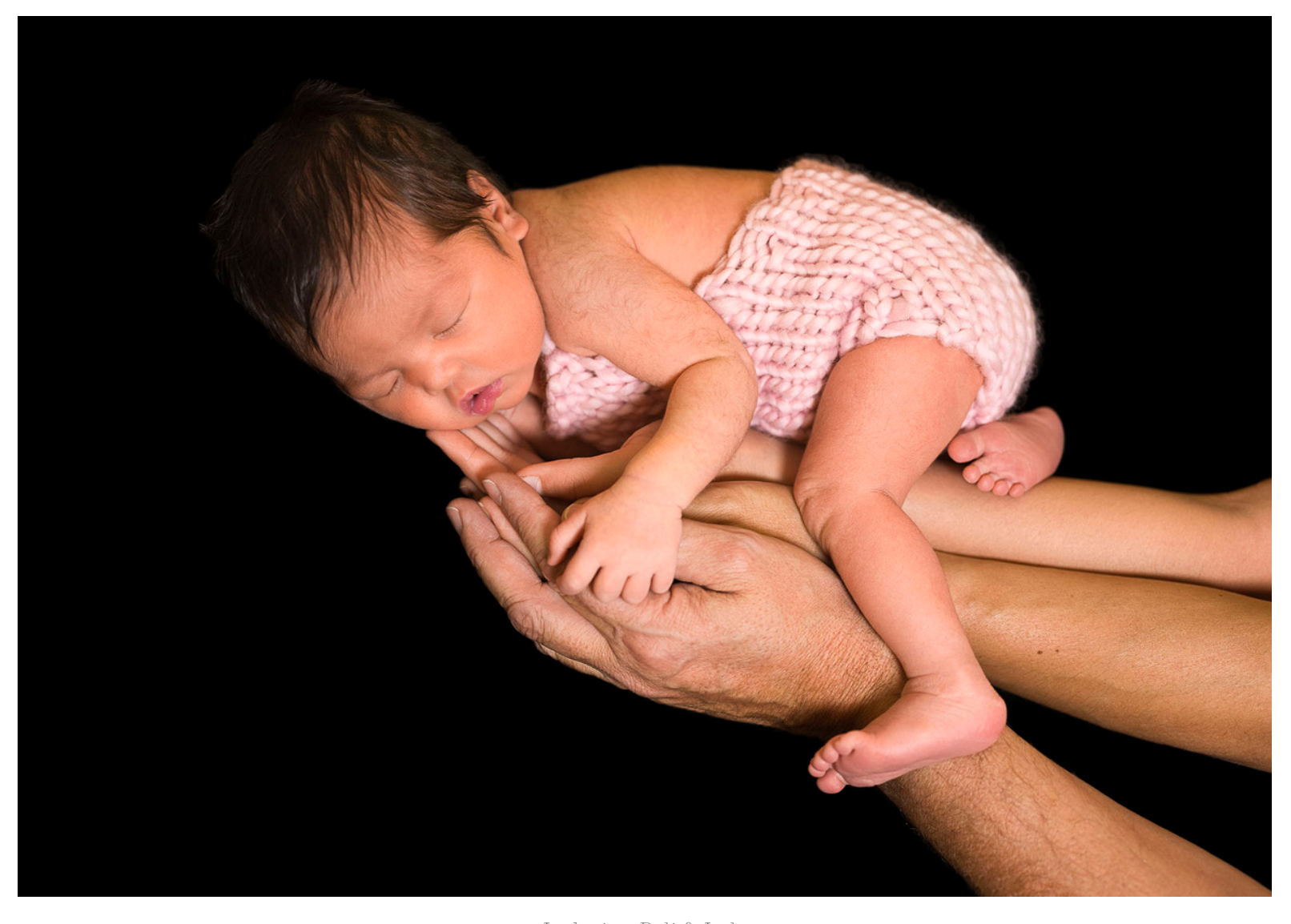
\label{eq:Ludovica,Bali & Italy} $$ GFX 50S + GF63mmF2.8 at f/2.8, 1/125 sec, ISO 400

When taking newborn photographs there are many aspect to consider before starting shooting. Communication with parents is the first and most important step; parents, especially when they are still in the hospital, can be very fragile. Mums are like heroes in my mind and they need to know exactly what will happen to be able to trust you. You also, of course, must be able to handle the baby in the safest way. The thing that parents will always remember of you is the love and care you gave to their children in that special and unique moment.