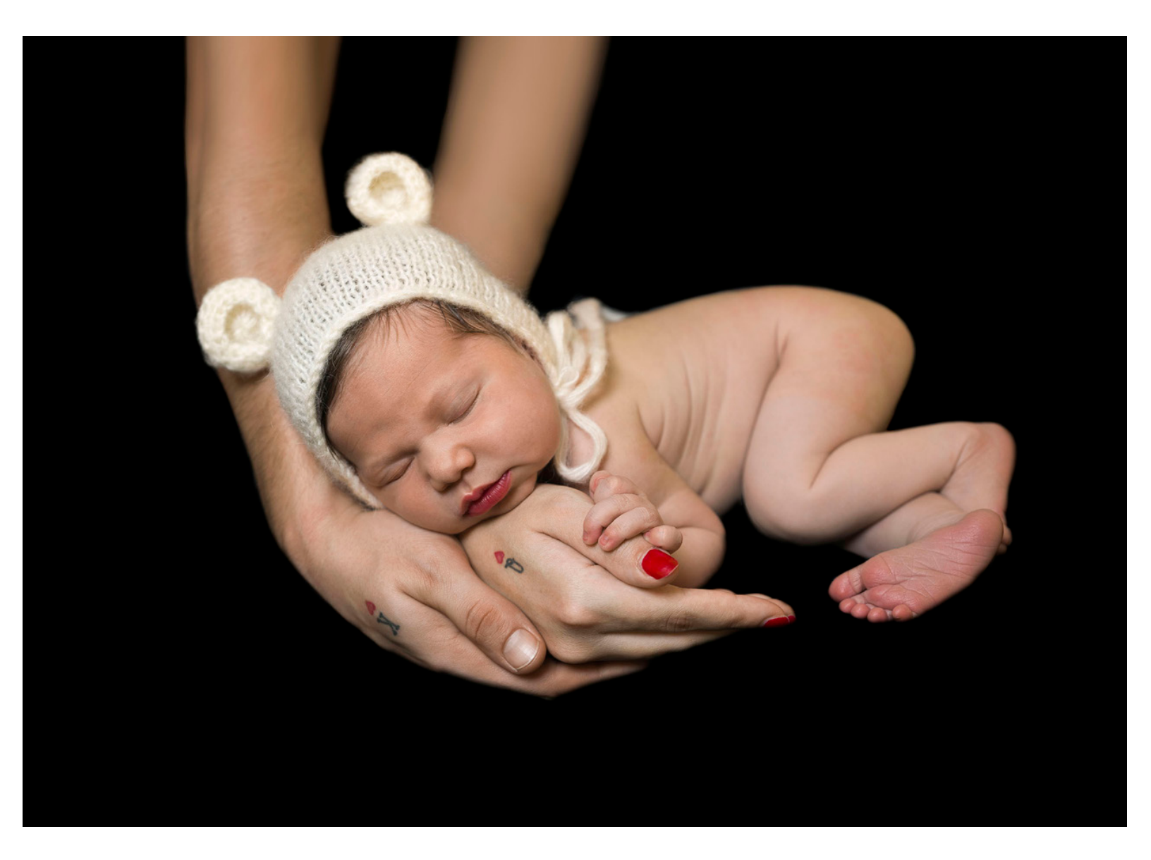
Aurora, Italy GFX 50S + GF32-64mmF4 at f/4, 1/125 sec, ISO 400