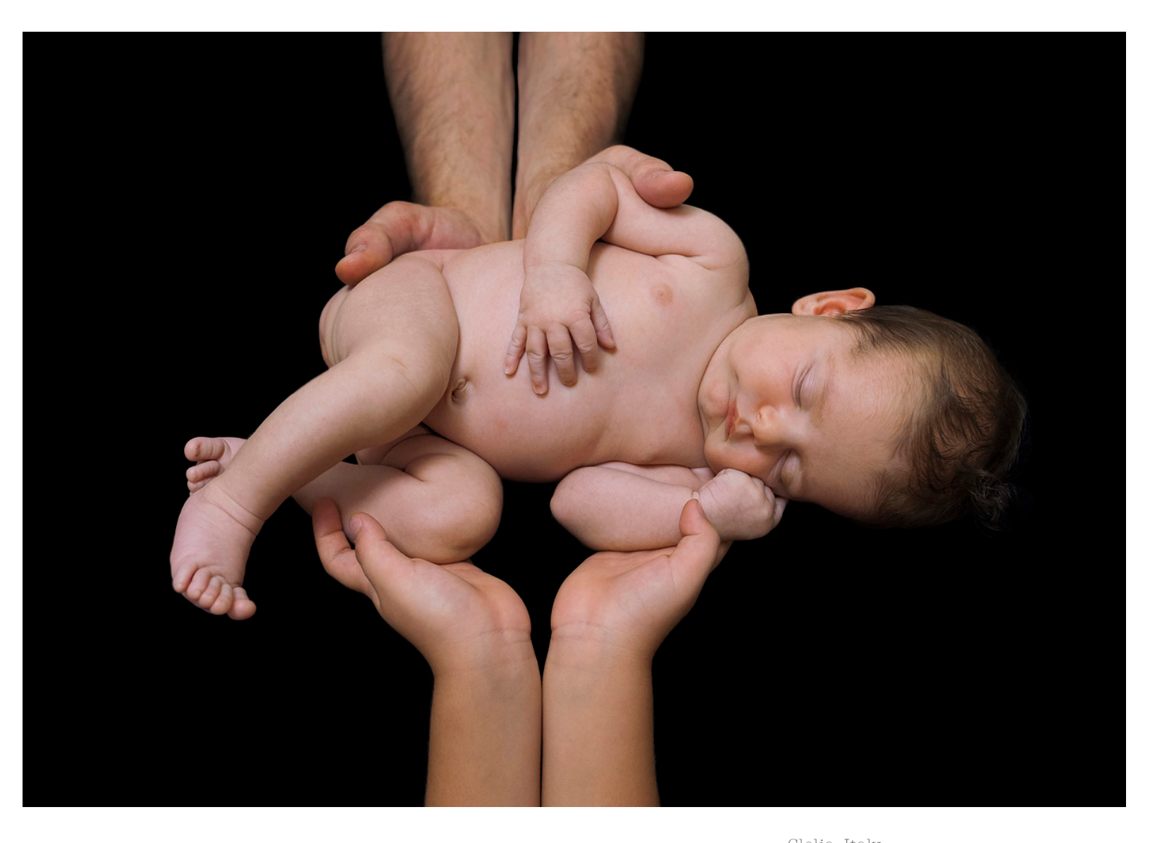
Clelia, Italy X-Pro2 + XF16-55mmF2.8 at f/2.8, 1/125 sec, ISO 800

n November 2017, I started my artistic project 'Scent of Life #inchildsrights'. The goal of the project was to depict the newborn baby as a representation of essence and poetry of life that has to be protected, respected and loved. The project also gave life to an exhibition, a multisensory installation that is now being shown in Italy.